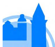
Leek High School